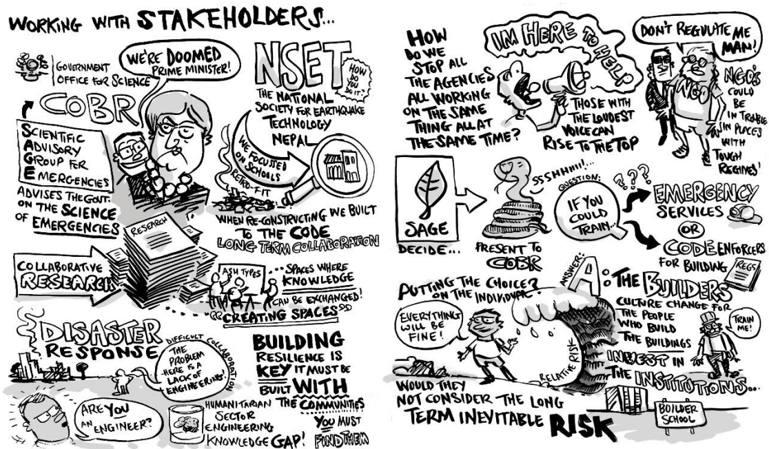
Fig. 4. Some of the points raised in the working with stakeholders panel discussion