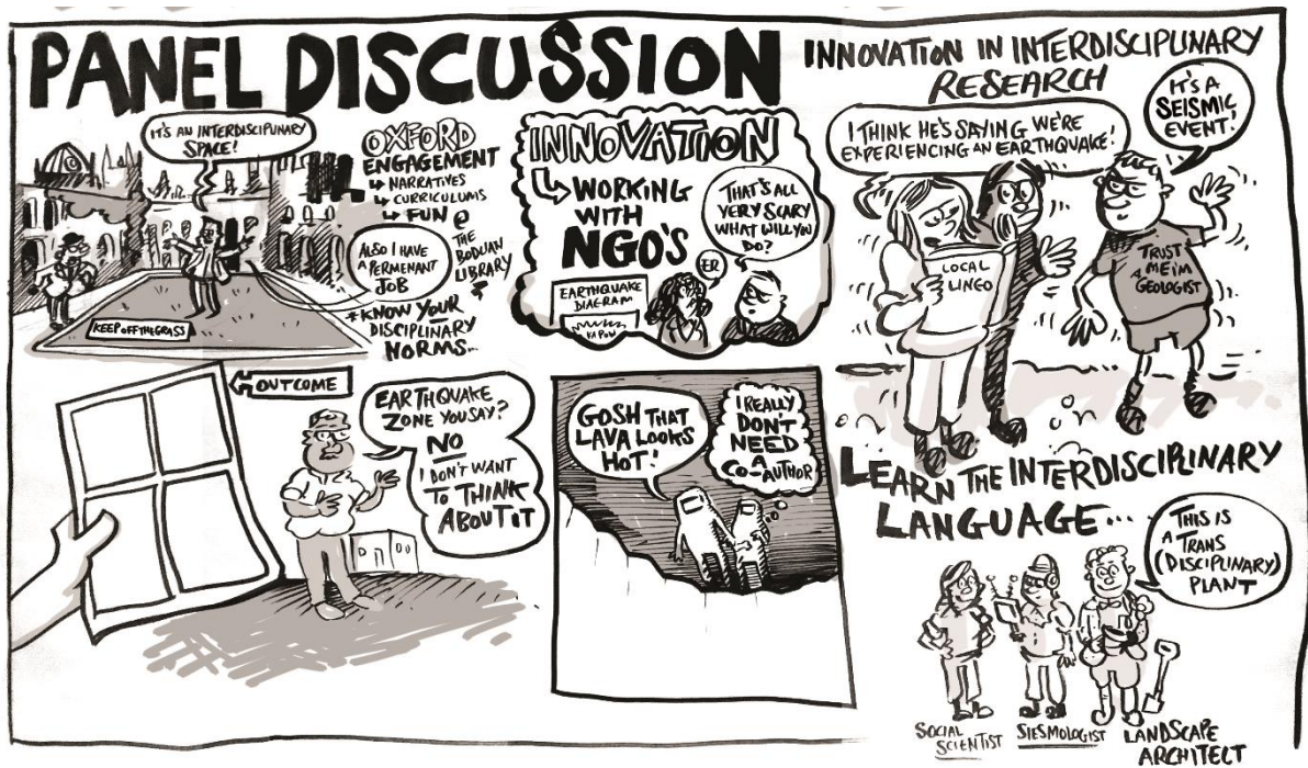
Fig. 5. Some of the points raised in the 'innovation in interdisciplinary research panel discussion (source: Chris Shipton, Live Illustration).